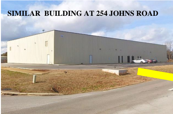
SIMILAR BUILDING AT 254 JOHNS ROAD